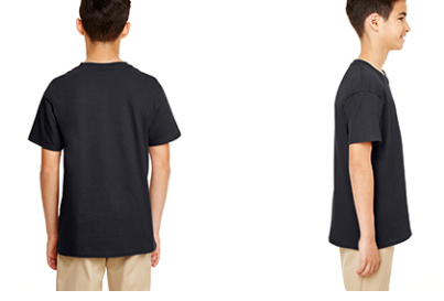
Featured Color: BLACK